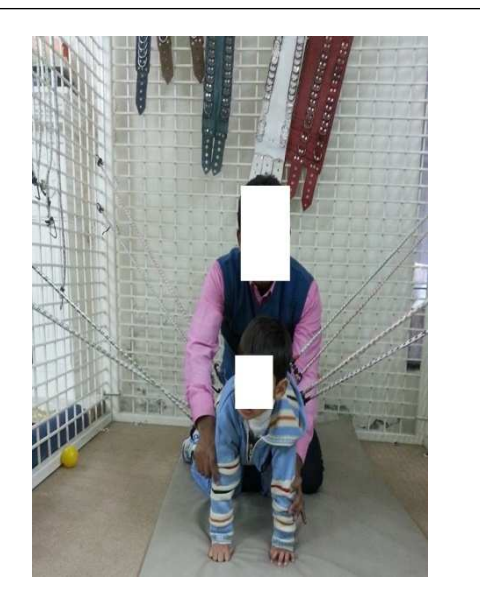
Figure 3: Quadruped training.