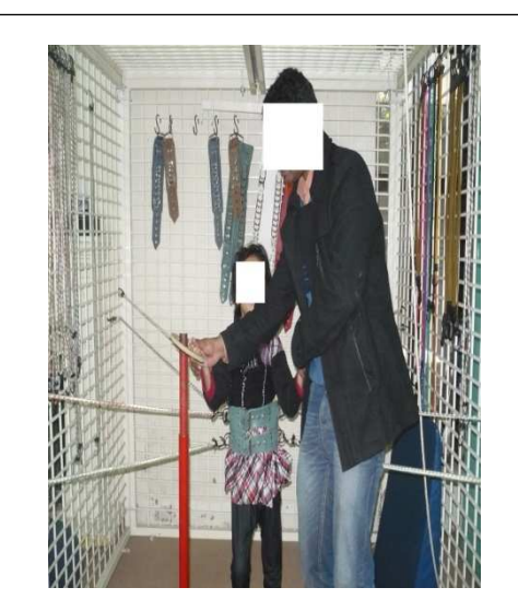
Figure 4: Standing with activity.